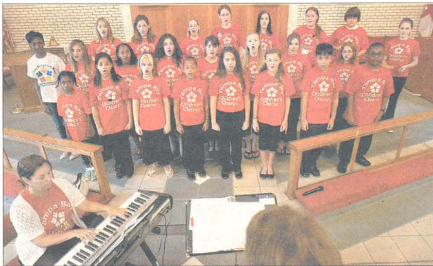
Rehearsals are from 6 to 8 p.m. every Monday night during the school year and alternate between St. Catherine's Episcopal Church and the Patel Conservatory at Tampa Bay Performing Arts Center.

"I'd been singing in my school chorus since the third grade, so at first I didn't really think I was going to be learning anything," she said. "But it's taught me how to better use my voice, like keeping the back of my mouth open and