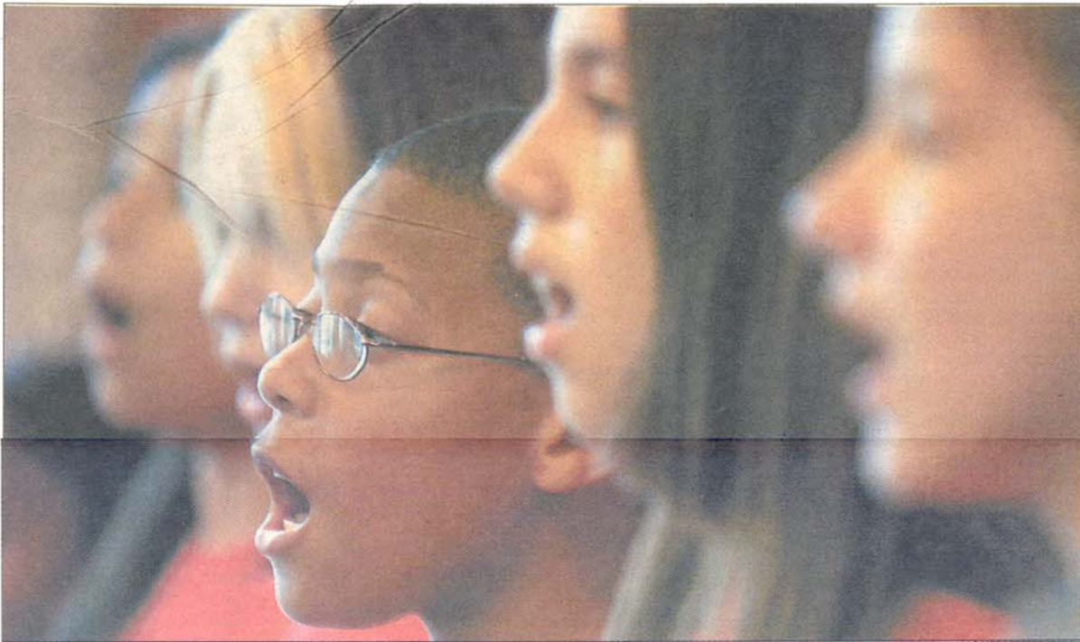
Tampa Bay Children's Chorus is composed of four groups, which are based on the student's age and ability.